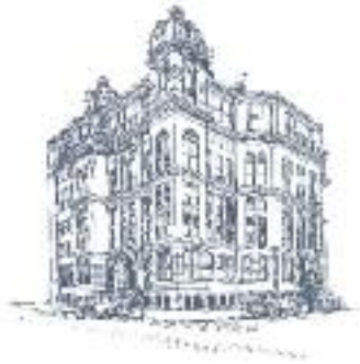
Harrison Street 1913