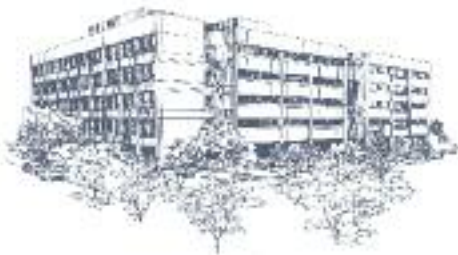
Paulina Street 1972