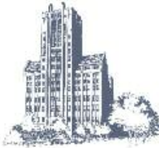
Wood Street 1937